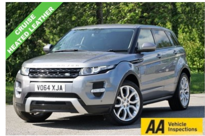
RANGE ROVER EVOQUE SD4 DYNAMIC Just £14,599