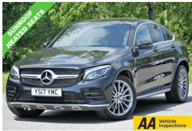
MERCEDES GLC 4-MATIC AMG LINE Just £28,799