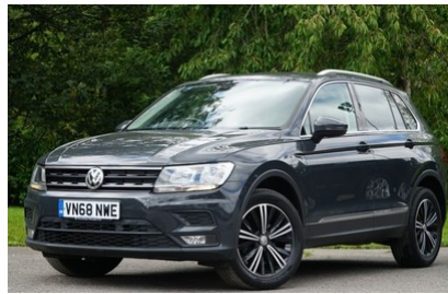
VW TIGUAN SE TDI 4-MOTION JUST £19,799