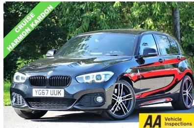
BMW 1 SERIES